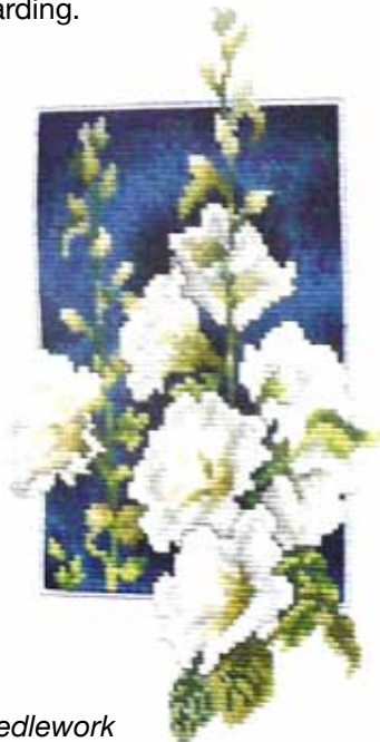
Two samples of Marilyn's needlework