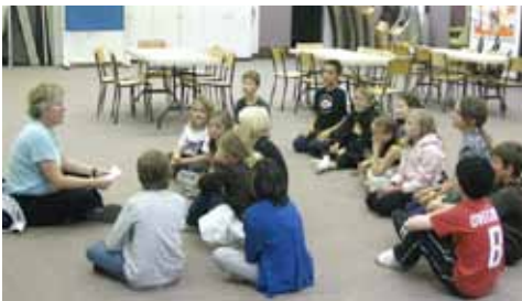
Above: The finished product Top Left and Bottom Left: Carving Pumpkins Left: A time to reflect and learn