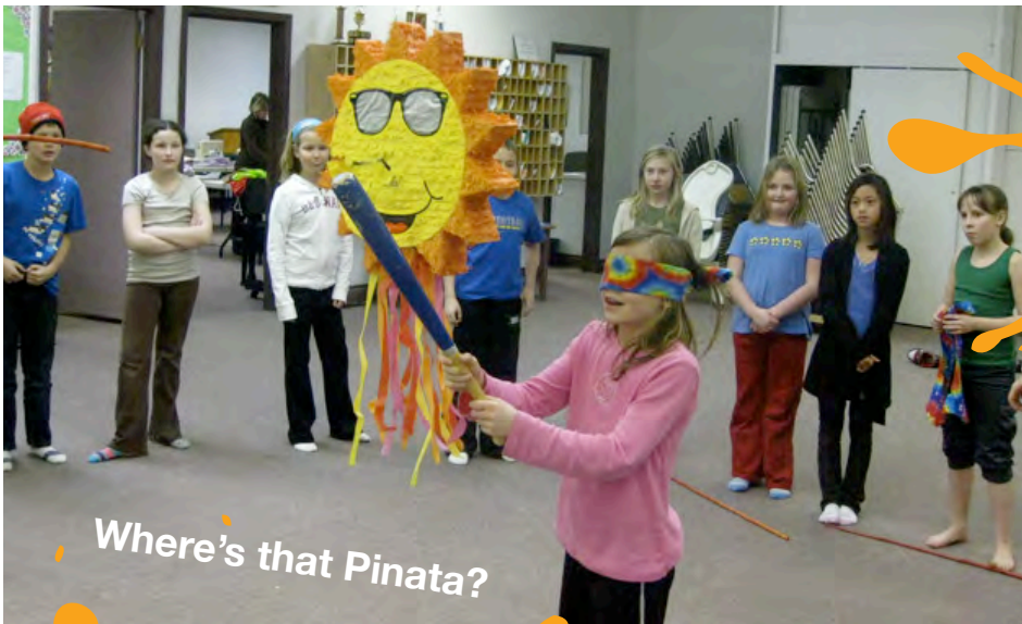
Where's that Pinata?