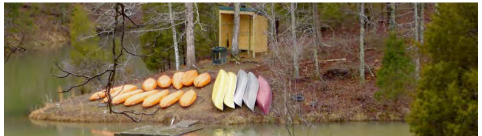
Right: View from the MDS Camp Lodge where the volunteers were housed

Thanks again to the AODBT staff members for the outstanding multimedia presentation revealing the exciting foyer project visual impact.